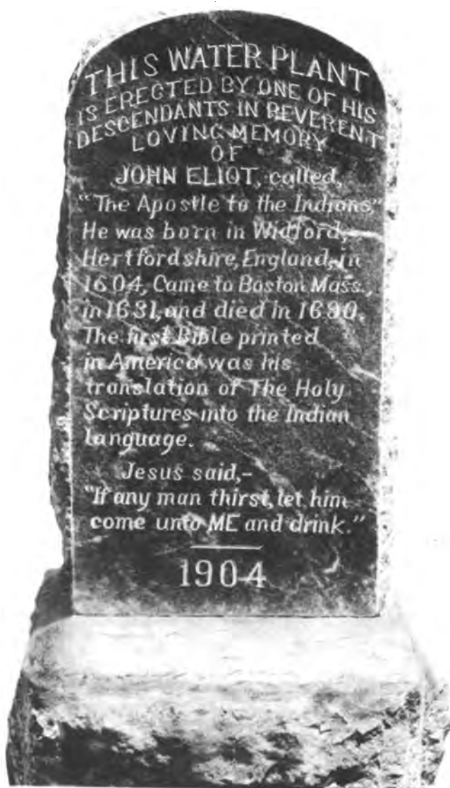
ELIOT MEMORIAL at Tucson, Arizona.