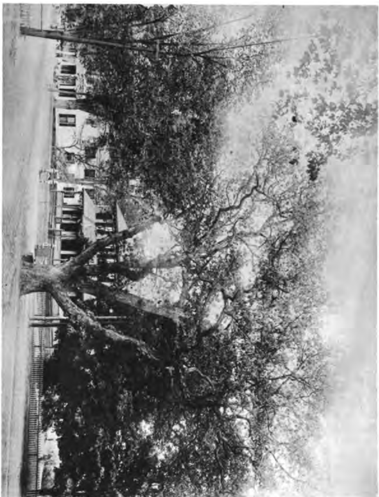
ELIOT OAK, AT NATICK, MASS., under which John Eliot is said to have preached to the Indians about 1651.