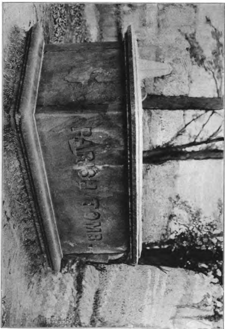
JOHN ELIOT'S GRAVE in Parish Tomb, at Roxbury, Mass.