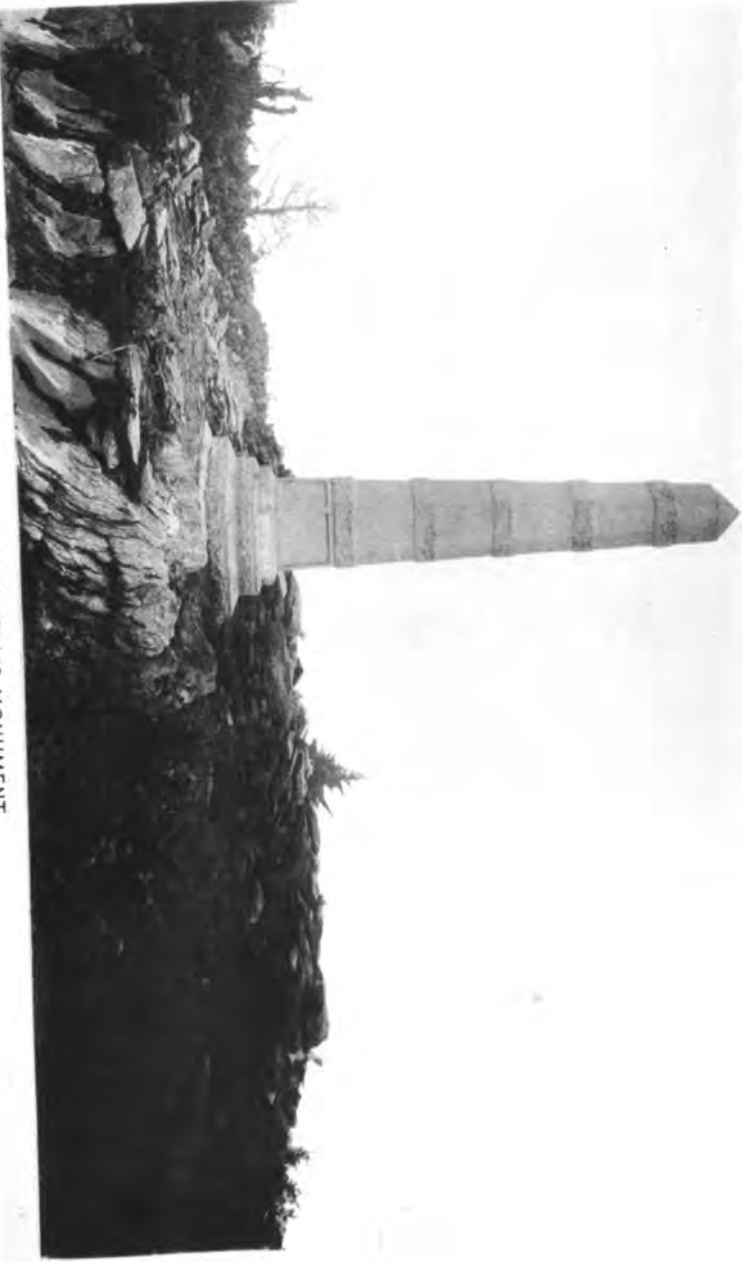
ELISHA MITCHELL'S MONUMENT on Mt. Mitchell, North Carolina.