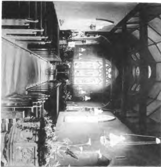
EXTERIOR AND INTERIOR OF THE CHURCH OF ST. JOHN THE BAPTIST at Widdford, England, where John Eliot was baptized in 1604.